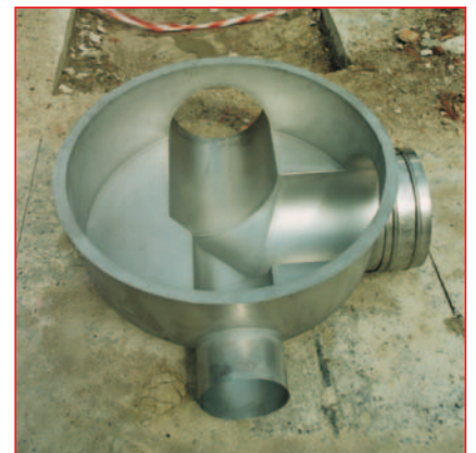
SG-RD Round manhole bottom, also suitable for use in existing manholes

What has made stainless steel manhole covers stand out, has been their corrosion and erosion resistant linings. Furthermore, the penetration of bacteria is impossible, as stainless steel has a hygienic surface.