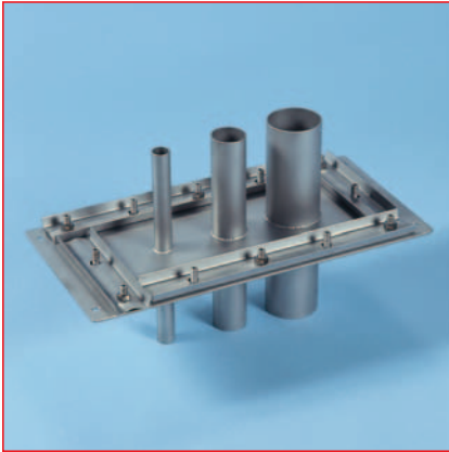
RDFN With adhesive flange or adhesive and clamping flange of 3 mm metal