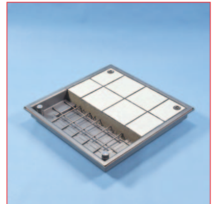
SA-E-BTF Square or round manhole covers for any surfaces

Moreover, back water safe drain covers can also be supplied.