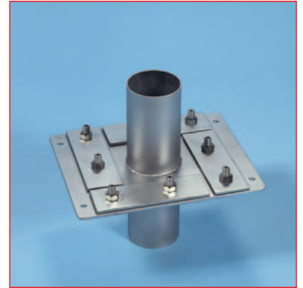
RDFD To DIN 18195 T9, with 6 mm thick adhesive and clamping flange

Whether fitted only with a clamping or adhesive flange, or with an adhesive flange and a supported flange to DIN18195 T9, you can rely on WALDNER pipe leadthroughs, with their qualitative highly grade processing and stability.