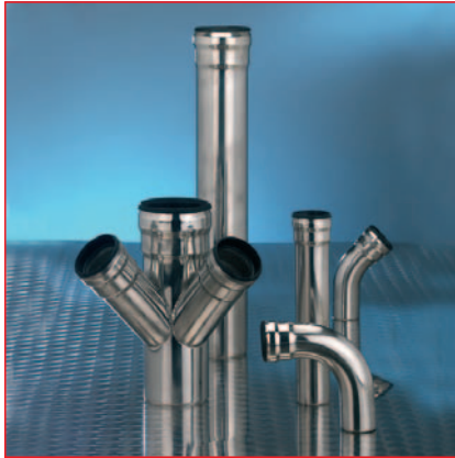
Stainless steel pipes as plug in socket system

The WALDNER drainage system is ideally completed with a waste water program as plug in socket system. Stainless steel pipes and stainless steel adapters are available in the sizes DN 40 to DN 250 in the materials 1.4301 (V2A) and 1.4571 (V4A)