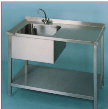
SPTG Sink without ground level, also available as table or work/sink cabinet

A lot of things are possible – just ask us.