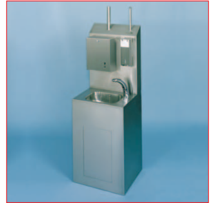
HWS Hygiene washstation, preinstalled and fully wired

To complete the hand wash programme, steel mesh waste paper bins, hand towel, soap and disinfectant dispensers with an hygienic steel cover are also available.