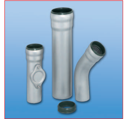
Several pipe designs possible

The WALDNER drainage system is ideally completed with a waste water program as plug in socket system. Stainless steel pipes and stainless steel adapters are available in the sizes DN 40 to DN 250 in the materials 1.4301 (V2A) and 1.4571 (V4A)