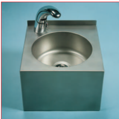
HWB-WH-RD Washbasin with touch-less fitting low-priced from the stock