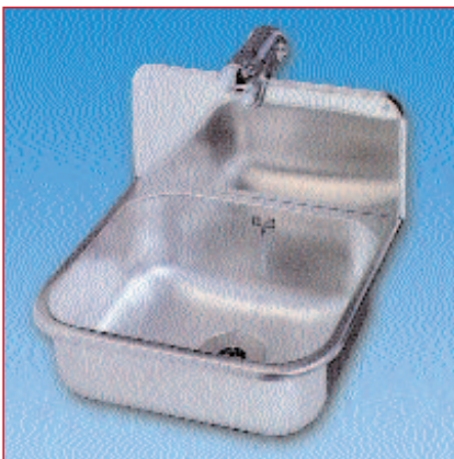
Sinks in several sizes

As well as hand hygiene, there must also be provisions for the cleaning of the clothing and equipment.