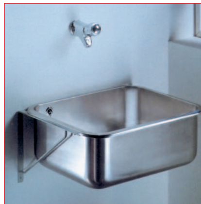
Universal basins in several sizes