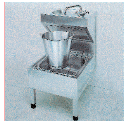
Combination wash hand basin sink