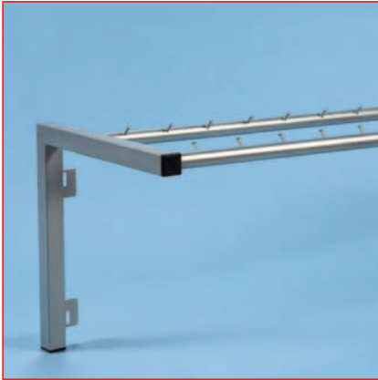
SH Apron suspensions for 18, 24 or 28 aprons