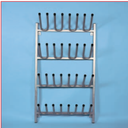
STH Boot rack for 20, 24 or 28 pairs of boots