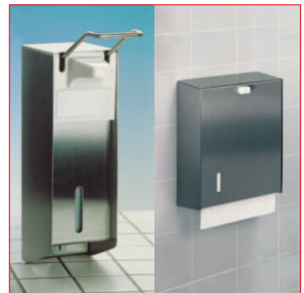
Towel, soap and antiseptic dispenser out of stainless steel