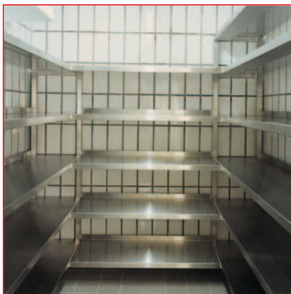
RGB Shelf installations are available as standing or wall fixed units