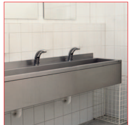
HWR Hand wash channel for two, three or four bays