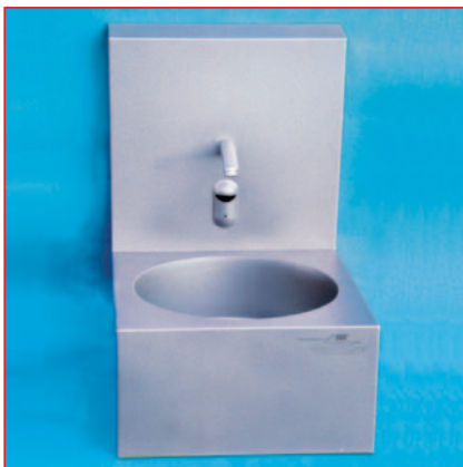
HWB-WH-RD-AW Washbasin with back wall and inte- grated touchless fitting, battery or power operated