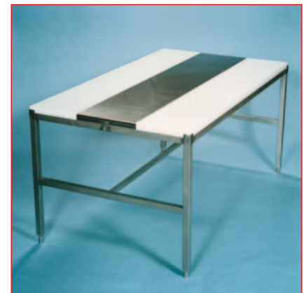
ZT Hygienic cutting table removable cutting boards and removable stainless steel panel