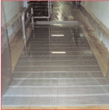
DDSB Disinfection walk through basins, also available as drive through basins