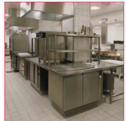
Single standard elements can be put together to form an effective whole