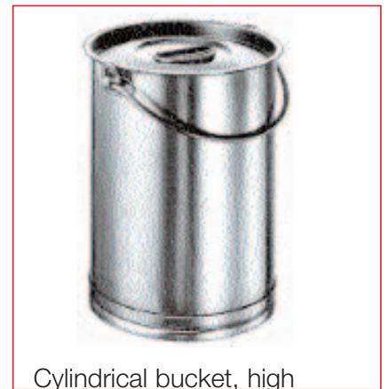
Cylindrical bucket, high