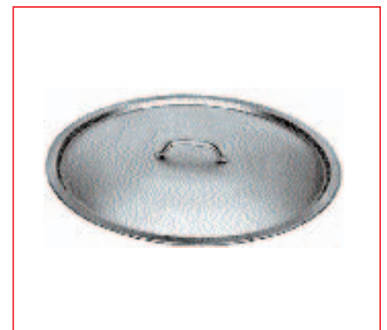
Lid for bucket