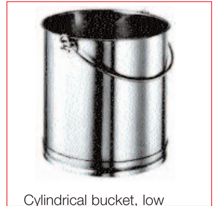
Cylindrical bucket, low

On request all containers and bins can be equipped with your company's logo (etching by means of Pico process).