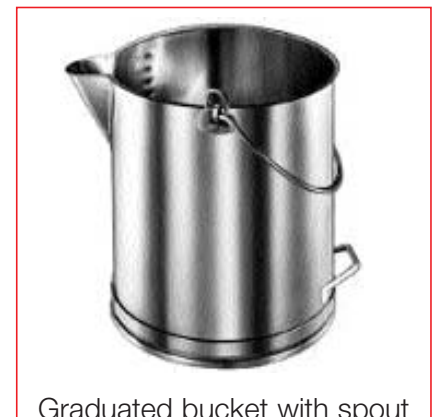
Graduated bucket with spout