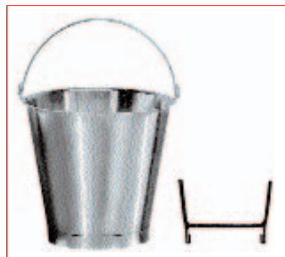
Bucket with bottom ring