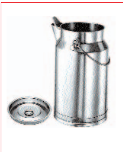
Transport can with spout