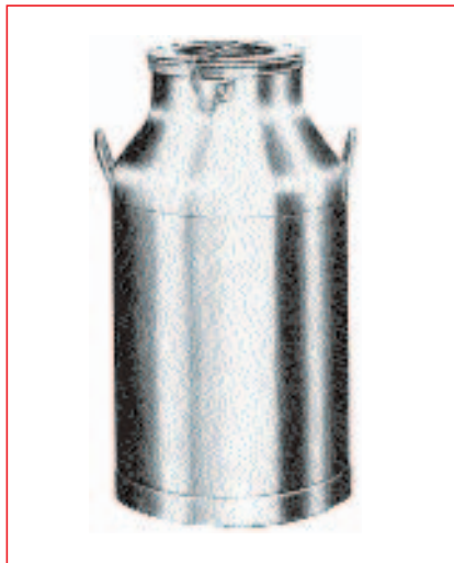
Transport can with lid and chain

All transport containers and cans are made of material 1.4301 (V2A). Individual designs can also be offered in material 1.4436.